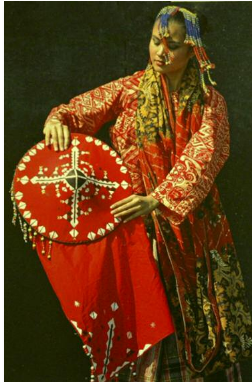
"Filipino Folk Dancer with a Round Sallakot" by Cecilia Vidal of Millbrae C C; Winner: CO/AMA