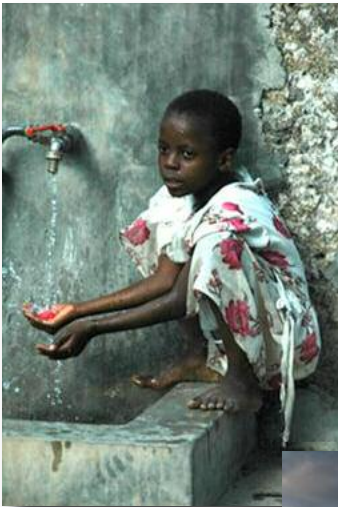
Above: "Cooling Off at Zanzibar, Africa" by Beth Wensley of Peninsula CC; Winner: Travel A Pls