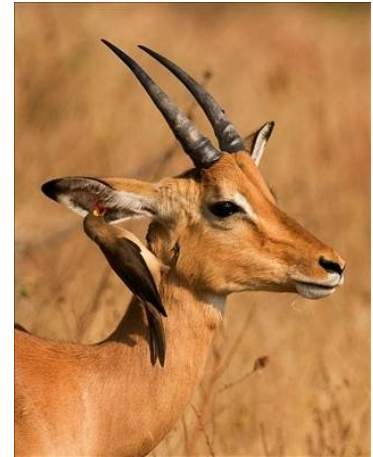
Berkeley Camera Club