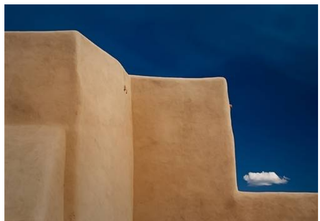
Honorable Mention Pictorial Projected Images - Masters The Cloud and the Adobe Church Dick Stahlke Contra Costa Camera Club