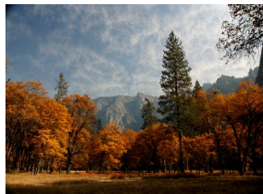
The Colors of Fall in California State Parks