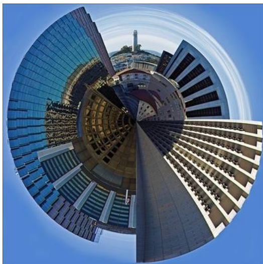
Third Place - Creative Projected Images - Basic Spin City Sean McDonough Rossmoor Camera Club