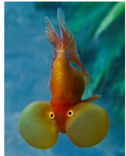
Fifth Place Nature Projected Images - Basic Chinese Goldfish Demonstrates Defensive Posture Tim Szumowski Contra Costa Camera Club